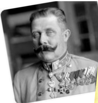
Archduke Franz Ferdinand