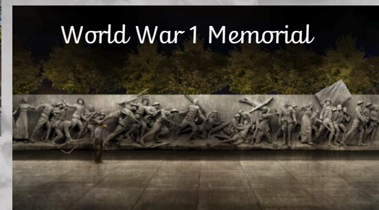
World War 1 Memorial