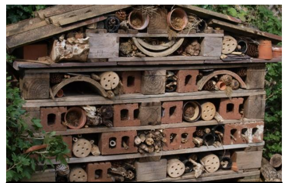
Faversham Abbey Physic garden