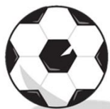
la educación física